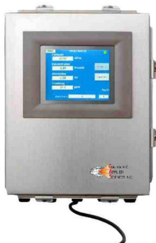
Model Messenger with Panel PC

Universal Transmitter, Monitek Product Line of Galvanic Applied Sciences Inc.