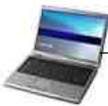
Laptop / Netbook